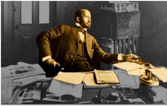
The Clark Atlanta University Department of History announces an extraordinary sankofa odyssey: a literary sojourn...